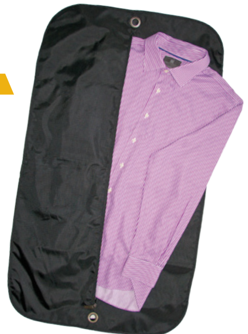
INSIDE OPEN VIEW