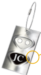
Position B Permanent

Select a "Stock" or "Custom" medallion for Nest 1