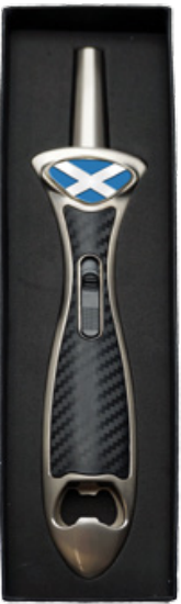
New Gift Box