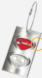
Position A Permanent

Select one of our many products Each has two medallion positions